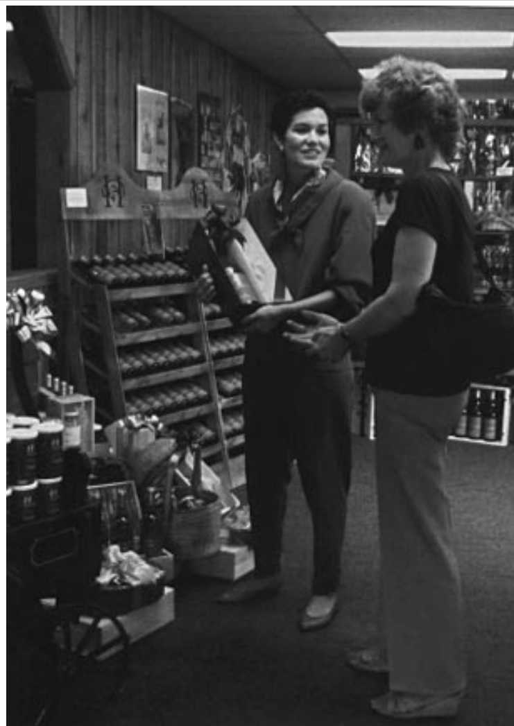
A well-organized and attractive display sales room not only enhances the image of the winery, but it can serve as a good place to sell specialty foods and wine accessories. This sales room is located at The Hogue Cellars near Prosser, Washington.