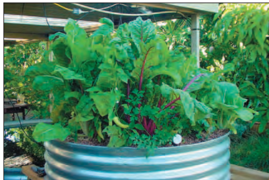
Aquaponic vegetable bed in Australia.

Aquaponics is a bio-integrated system that links recirculating aquaculture with hydroponic vegetable, flower, and/or herb production. Recent advances by researchers and growers alike have turned aquaponics into a working model of sustainable food production. This publication provides an introduction to aquaponics with brief profiles of working units around the country. An extensive list of resources point the reader to print and Web-based educational materials for further technical assistance.