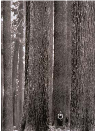
Nineteenth century travelers described open groves in Sierra forests, where navigating, often by car, was easy.

Our curiosity and examination has led us to understand the importance of restoring fire to ecosystems, but how do those ecosystems respond where fire has been reduced, or excluded, for so long? Can historic forest community