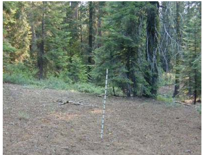
Bare ground forest.

Treatment areas were split between those receiving prescribed burning, and those remaining unburned. The treatment areas were further divided into three thinning treatments in which plots were not thinned; were thinned in the understory by removing mid-level plants; or had the overstory thinned by removing the tallest trees in the canopy (shelterwood). Thin and burn treatments removed more understory trees than thinning alone. Removing the canopy trees (shelterwood), reduced densities the most.