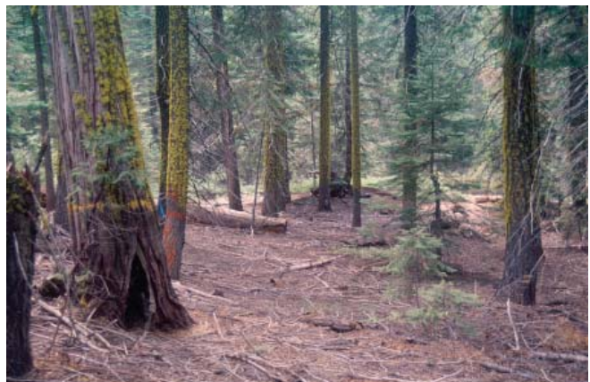
Closed canopy forest.