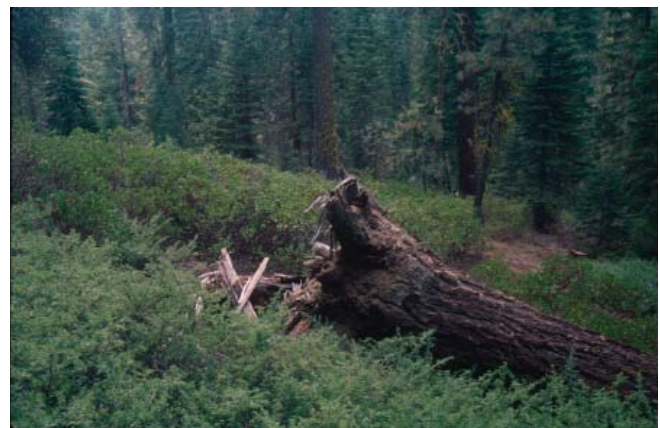
Shrub patch forest.