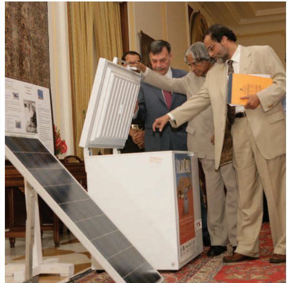
Hot technology. India's president A.P.J. Abdul Kalam views the SolarChill fridge, which should soon earn WHO approval.