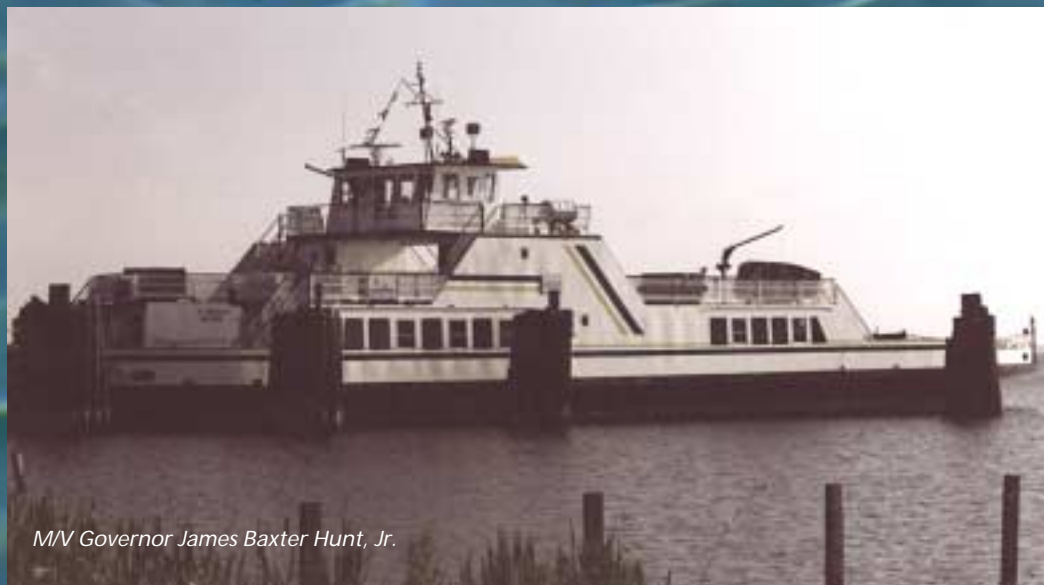
M/V Governor James Baxter Hunt, Jr.

Coastal 2000 provides a complement to the ferry data, using probabilistic methods