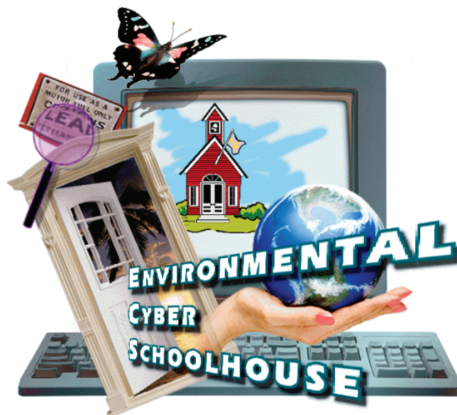
Environmental Cyber Schoolhouse

staff. After learning about the curricula, teachers may register their student group online and are given login codes for their students. They then also have access to teacher's notes and a discussion forum where they can exchange information with other educators. A Teacher Administration area allows them to check on their students' progress, download various