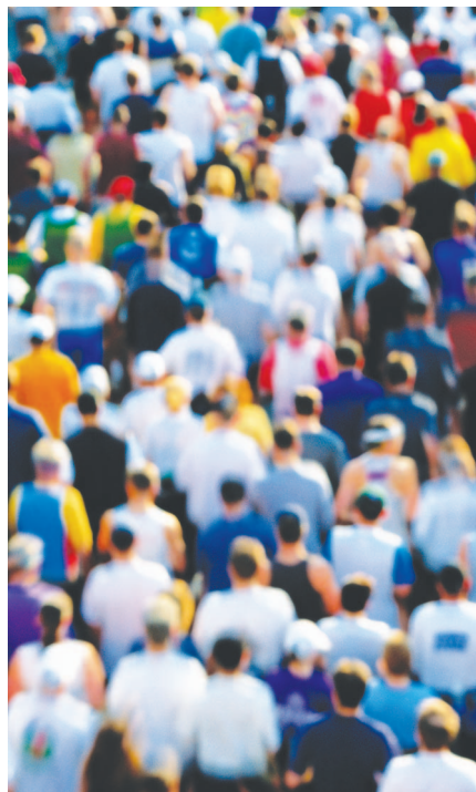
Created unequally? New NIH centers will look at issues of population and health disparities.