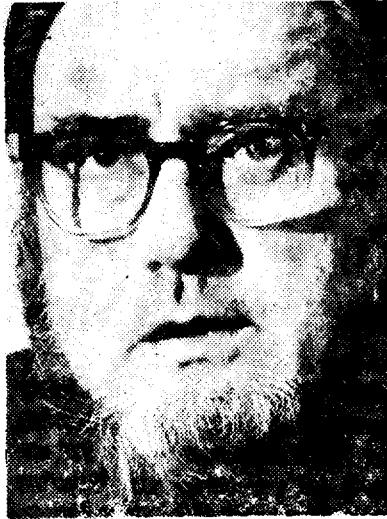
Dr. C. Everett Koop

And the body of her sister was in a vehicle speeding home for burial before sundown.