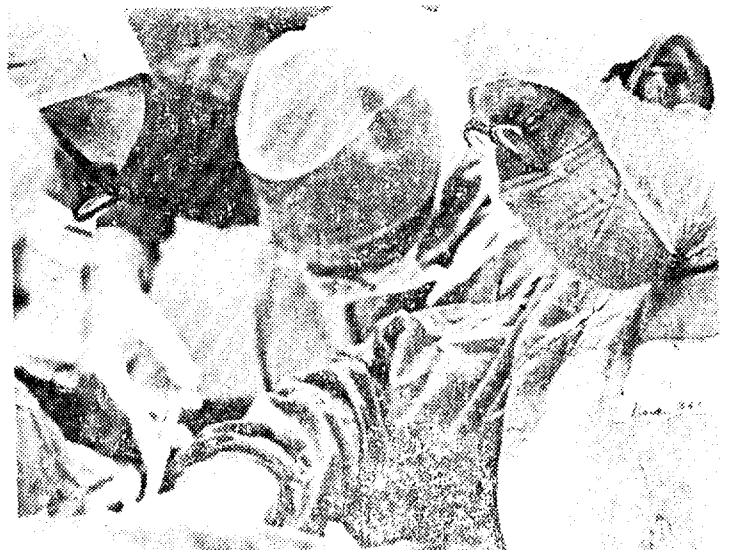
Dr. Koop (right) tends to one child after separation