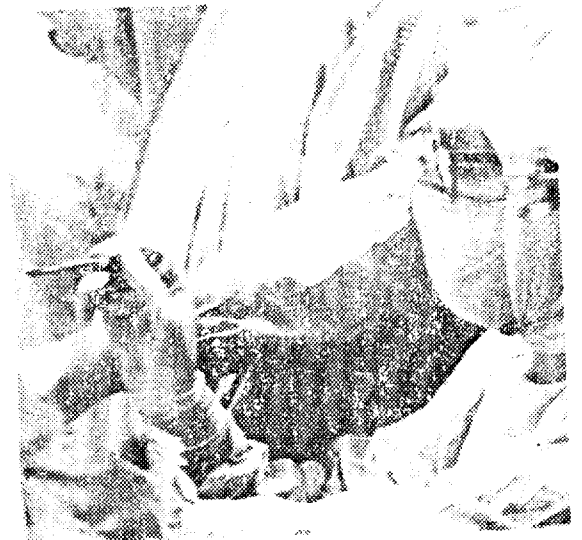
Dr. C. Everett Koop, chief surgeon