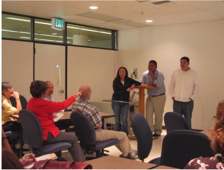
Tribal Fellows visit Biomed in March 2007