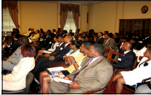
"What's At Stake In 08" CBC Youth Outreach Session