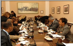
CBC Meets with Liberian President Ellen Johnson-Sirleaf