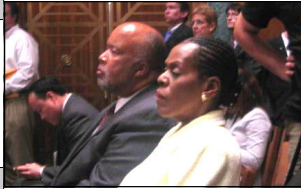
CBC Attends Judge Southwick Senate Hearing