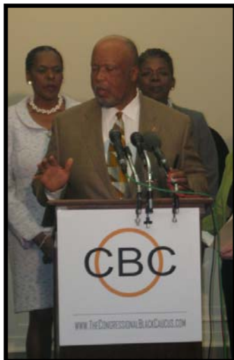
Congressman Bennie Thompson (MS) speaks at a CBC press conference.

The Majority Whip, Congressman James E. Clyburn (SC) , and Congressmen Bennie G. Thompson (MS) and G.K. Butterfield co-chaired the CBC Agriculture Taskforce , which pushed for sweeping improvements in the Farm, Nutrition and Bioenergy Act of 2007 . Senator Barack Obama (IL) played a key role in ensuring the CBC's priorities remained in the Senate version; the bill awaits conference committee and final passage. Among the victories in the bill, the CBC supports: