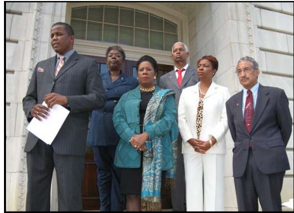
CBC Members address the press on Capitol Hill regarding diversity in the military. CBC Members Meek (FL), Tubbs Jones (OH), Jackson Lee (TX), H. Johnson (GA), Clarke (NY), B. Scott (VA) are shown here.

Joined by Armed Services Committee Member Congressman Kendrick B. Meek (FL) , the CBC Defense & Veterans Taskforce addressed issues of diversity in the military. Since the complete integration of the U.S. armed forces 58 years ago, particularly since the advent of the all-volunteer force, the Department of Defense has been a leader in the integration of talented women and minorities into management and leadership ranks. However, minorities continue to be overrep-