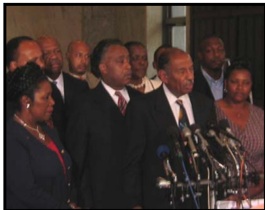
Congressman John Conyers (MI) leads press conference for Jena 6 with CBC Members. CBC Members Jackson-Lee (TX), Cummings (MD), Kilpatrick (MI) are shown here.