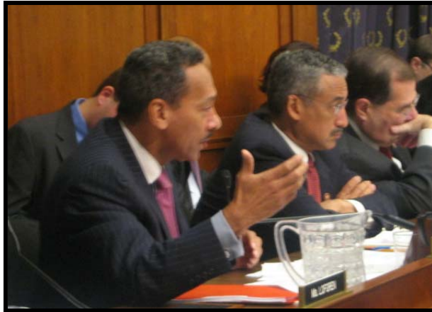
Congressmen Mel Watt (NC) and Bobby Scott (VA) in a House Judiciary Committee hearing.

The CBC Small Business Taskforce , co-chaired by Congressmen Albert Wynn (MD) and David Scott (GA) , focused on expanding and improving opportunities for small and minority-owned businesses , particularly in the areas of government contracting and media access and ownership.