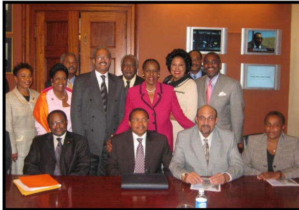
CBC Members met with President Jakaya Kikwete of Tanzania. CBC Members Lee (CA), Jackson Lee (TX), Payne (NJ), Fattah (PA), D. Davis (IL), Kilpatrick (MI), Watson (CA), Cleaver (MO), and Meeks (NY) are shown here.

regarding legislation and policy positions to CBC offices and highlighting legislation of interest to the labor community. The CBC also celebrated the passage of the minimum wage increase . The federal minimum wage was increased to $7.25 an hour over the next two years. Nearly 13 million Americans will benefit. The Taskforce is chaired by Congressman John Lewis (GA) .