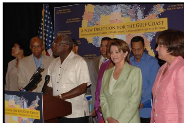
Majority Whip James E. Clyburn (SC) and Speaker Nancy Pelosi (CA) led a Congressional delegation to New Orleans to discuss Gulf Coast development. CBC Members Watson (CA), Jefferson (LA), and Watt (NC) are shown here.

To address the nation's housing crisis Congresswoman Maxine Waters (CA) and Congressman Wm. Lacy