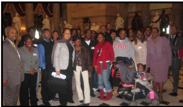
CBC Members meet with Black Youth Vote during their annual Capitol Hill visit. CBC Members Payne (NJ), Richardson (CA) and Kilpatrick (MI) are shown here.

In June, the CBC Emerging Leaders Taskforce , chaired by Congressman Kendrick Meek (FL) and Congresswoman Yvette Clarke (NY) , hosted a dialogue with some of our nation's African American youth activists to discuss "What's At Stake in 08." The meeting, which took place on Capitol Hill, served as an opportunity for the young leaders to share the issues facing their communities and make recommendations on moving African American communities forward. The Taskforce also continues to show support for Congressman Bobby Scott's Youth Promise Act , which provides resources to communities committed to addressing issues of gang violence. The Taskforce will continue to engage young community leaders on the subject of rehabilitation versus incarceration programs.