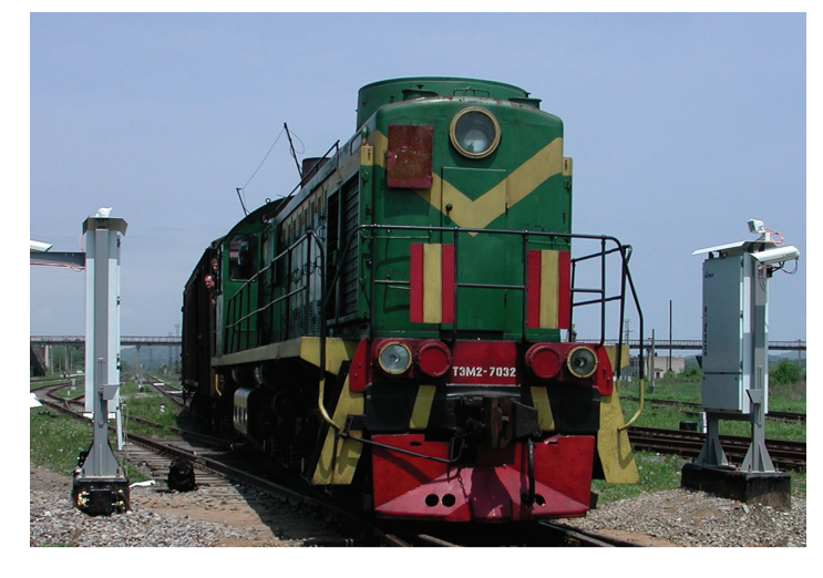
Radiation-monitoring systems in Russia and key borders

facilities called MaRIE, or Material-Radiation Interaction in Extremes. The purpose of MaRIE is to provide tools that would allow the Laboratory to address the critical materials-related scientific questions relevant to a broad spectrum of current and future missions.