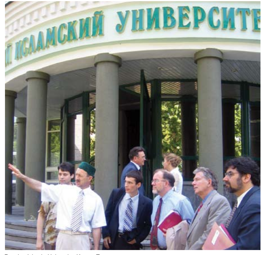
Russian Islamic University, Kazan, Tatarstan