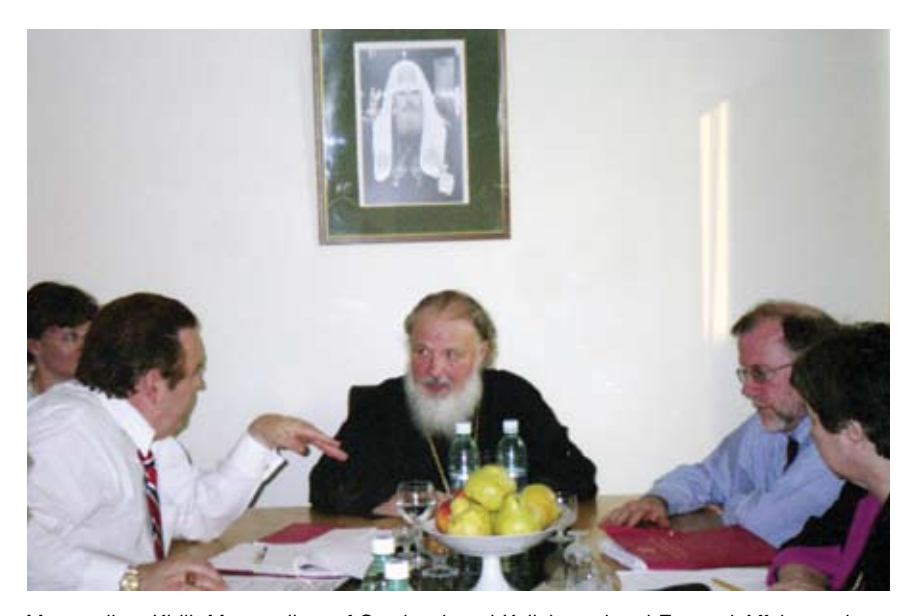
Metropolitan Kirill, Metropolitan of Smolensk and Kaliningrad and External Affairs spokesman of the Moscow Patriarchate of the Russian Orthodox Church, meeting with the Commission delegation

In June, during his meeting with the Commission delegation, Metropolitan Kirill affirmed the norms in the Universal Declaration of Human Rights. At the same time, however, Kirill expressed three main concerns about international human rights norms and their application in Russia: human rights may be used "to offend or desecrate holy things;" human rights may "defame people" or be used as "an excuse for certain unacceptable acts;" and laws created under the guise of promoting human rights may be used "to destroy morality" and related values. In Kirill's view, human rights must be connected to ethical and moral "values" rather than what he claims are simply "political agendas."