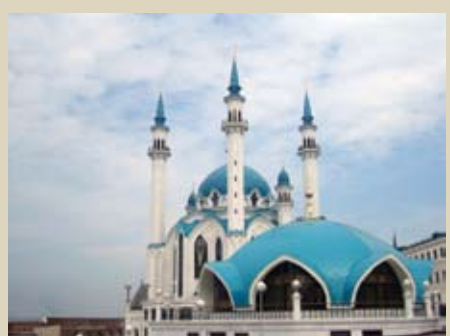
Kul Sharif Mosque, Kazan, Tatarstan

Many of the problems faced by minority religious communities in Russia stem from the notion set forth in the preface to the 1997 law that only four religions—