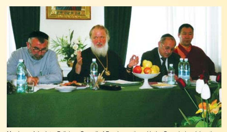
Members of the Inter-Religious Council of Russia meeting with the Commission delegation

its charter when it conducted religious activities in military units. If the church does not change its charter accordingly, it will face court proceedings that could lead to its liquidation.