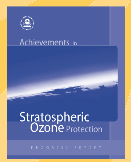
EPA's Office of Air and Radiation, Stratospheric Protection Division.

EPA developed a progress report and poster that highlighted the historical timeline of events associated with the Montreal Protocol and the achievements that have been made over the past two decades to phase out ozone-depleting substances. The internationally-acclaimed progress report and award-winning poster are available at www.epa.gov/ozone/strathome.html.