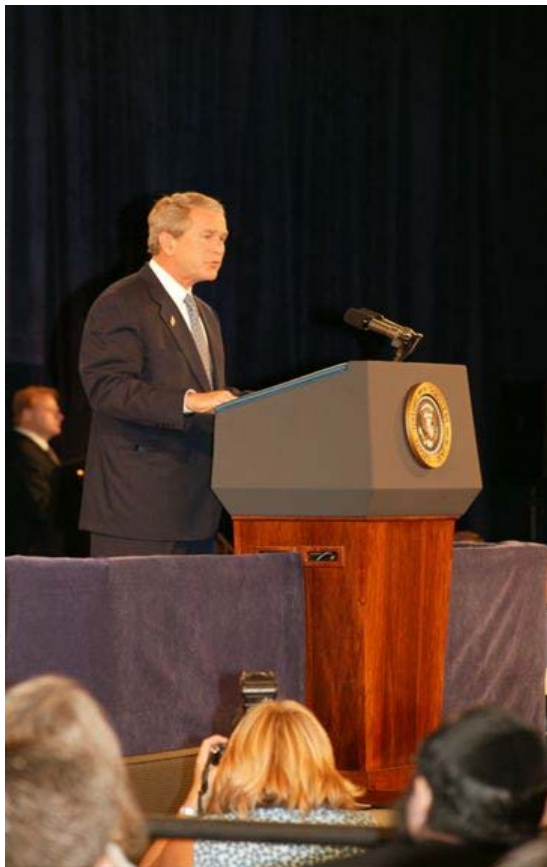
President George W. Bush addresses the National Conference on Human Trafficking in Tampa, Florida.

Human life is the gift of our Creator -- and it should never be for sale. (Applause.) It takes a special kind of depravity to exploit and hurt the most vulnerable members of society. Human traffickers rob children of their innocence, they expose them to the worst of life before they have seen much of life. Traffickers tear families apart. They treat their victims as nothing more than goods and commodities for sale to the highest bidder.