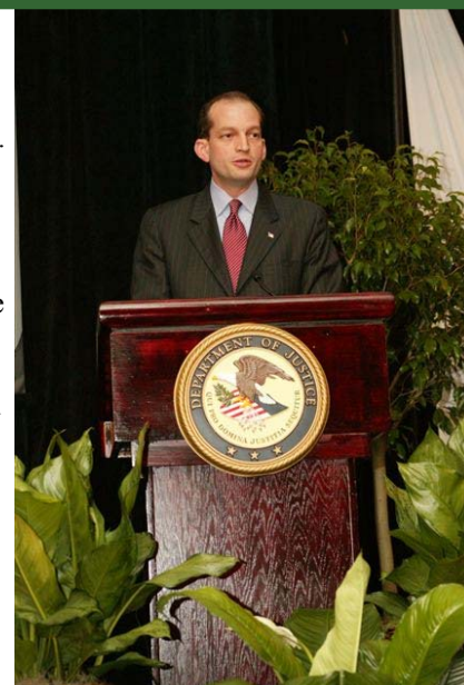
Assistant Attorney General R. Alexander Acosta addresses the National Conference on Human Trafficking in Tampa, Florida.

In the past, we established task forces in Tampa, Phoenix, Philadelphia and Atlanta and most recently in Northern Virginia along with the Department of Health and Human Services. These task forces are important because they work at the grass roots level to bring local law enforcement, service providers, DOJ and HHS together to create local network to focus on this issue.