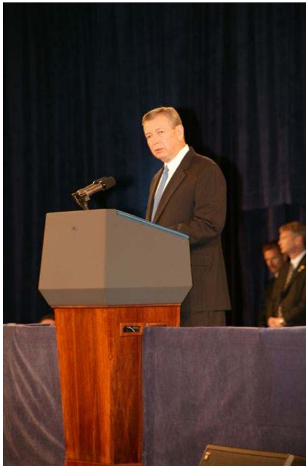
Attorney General John Ashcroft addresses the National Conference on Human Trafficking in Tampa, Florida.

Last January, the Justice Department's Civil Rights Division prosecuted and convicted six defendants for their