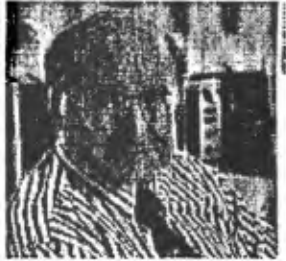
Privacy expert Alan F. Westin: "Monitoring that creates feelings of surveillance and stress is antithetical to the new cultures of management."

Macworld survey, 12 percent of responding employers endorse monitoring for evaluating performance or productivity.