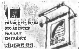
Phone debit cards, such as this one from France, work like computer transit tickets. Each call's cost is deducted from the prepaid card, obviating detailed billing records.

from these computerized systems is open to other government agencies and corporations, or sold to thousands of commercial data banks that trade on records about your home, possessions, stock transactions, family characteristics, and buying habits.