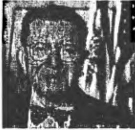
Senator Paul Simon: "Employees should not be forced to give up their freedom, dignity, or sacrifice their health when they go to work."