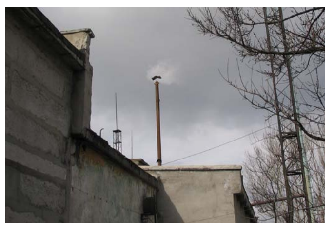
Figure 2. Venting of methane at the Bazhanov Mine.

safety. Each year, hundreds of coal miners are killed in Ukrainian mines, mostly due to methane-related explosions and fires – a fatality rate more than 100 times that of US coal mines, equating to a fatality rate of six workers for every one million tonnes of coal produced.