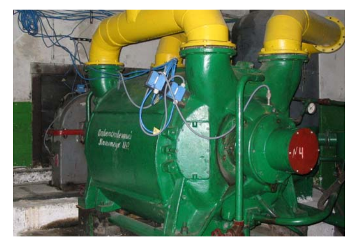
Figure 4. Vacuum pump for methane extraction used at the Bazhanov mine.

crease the domestic supply of natural gas, as well as increase the safety and environmental quality of the mines in the region. The analysis will focus on developing the best technical and economic approach for degassing Donetsk regional coalmines; evaluating the technical and economic merits of producing CMM; assessing the most likely markets and infrastructure required to utilize CMM and CBM; and developing a financing strategy, taking into account the potential for carbon credit sales. In addition, the environmental benefits of methane capture and carbon dioxide sequestration will be evaluated, with a focus on the