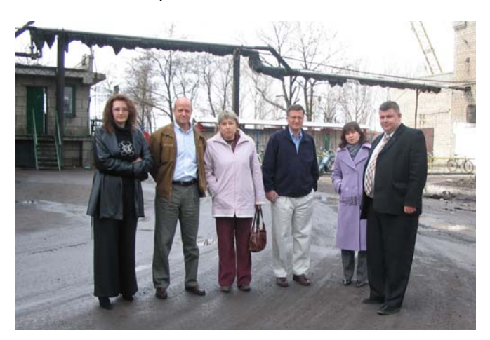
Figure 3. USTDA study group members at the Bazhanov mine in the Donetsk coal basin in June 2006.

The USTDA-funded study will examine the possibility of commercial development of CMM/CBM in Donbass to in-