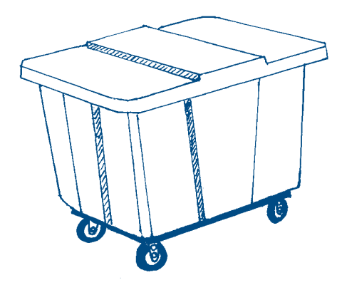
Figure 1. Rigid polyethylene bin on wheels

Every museum should have a complete range of supplies on hand to clean up spills from broken pipes, roof leaks, or malfunctioning sprinkler heads, and to remove excess water from collection objects. There are a number of options for storing and transporting these supplies depending on the size and configuration of your collection areas. Rolling utility cabinets, and lidded, rigid polyethylene bins or trash bins with wheels (small enough so that you can reach the contents in the bottom) are possible containers.