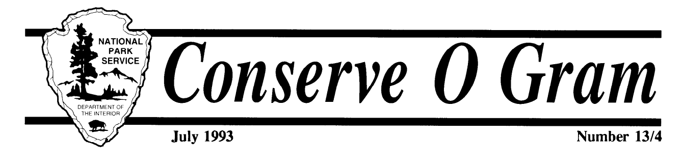
Exhibit Mounting Variations For Objects On Paper

Paper objects should not be placed on long-term or permanent exhibition because of their sensitivity to light. When planning for the temporary display of documents, works of art on paper, and photographs, ensure that mounting techniques meet the following criteria: