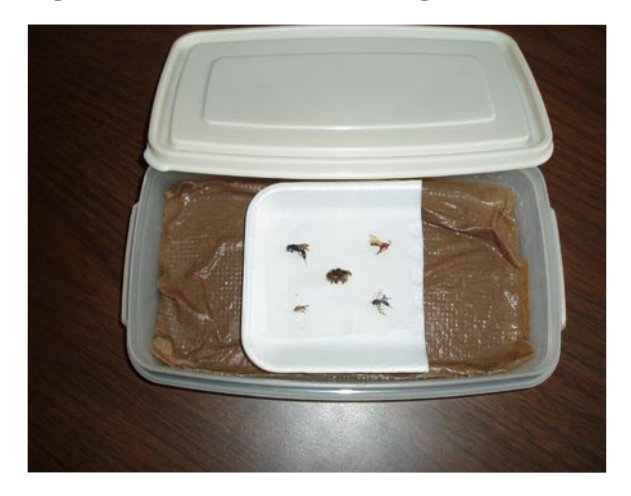
Figure 4: Two methods for relaxing insects.

alcohol and subsequent curatorial time and materials in maintaining these types of specimens. Larger collections will have dedicated storage for wet specimens. If your collection is small, there are unit trays for vials for use in insect drawers.