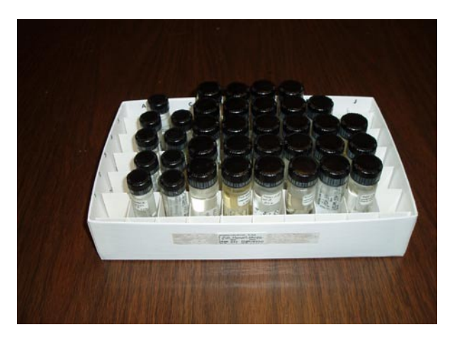
Figure 3: Storage of wet specimens, one option.

Insects collected in fluids may remain in fluid, be transferred to another fluid, or pinned, if appropriate. Collection fluids other than 70% alcohol are usually used for initial preservation purposes and not for long term storage. In general, all soft bodied insects should remain in 70% alcohol, whereas hard bodied specimens can be removed from alcohol, rinsed, relaxed if necessary (see relaxing specimens below), and pinned. There may be reasons to keep whole samples in alcohol. For example, it may be more efficient to keep fish stomach samples complete in individual vials rather than separate and pin some specimens.