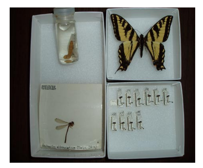
Figure 1: Various curation methods for insects.

Insects may be preserved either as dried or wet specimens. Dried specimens may be preserved on pins, mounted on points, or in envelopes. For pinned specimens, larger insects are pinned through their bodies and smaller insects are mounted on points. In larger collections not all specimens of butterflies and moths may be pinned. Some may be stored in glassine envelopes. The current standard for curating large collections of dragonflies and damselflies is placing specimens and supporting cards in clear envelopes.