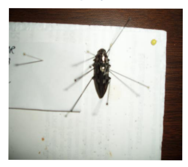
Figure 5: Specimens on pinning blocks.

Insects are placed in the chamber on platform above the damp substrate. Specimens will take from a couple hours to two days to relax. Adding a couple crushed cloves will prevent mold when relaxing larger, hard bodied insects that may take longer to soften. Most beetles, which are hard bodied, can be quickly relaxed by placing them in a hot water bath (almost, but not boiling) with a drop of detergent for 5-10 minutes. When softened they should be rinsed with another hot water bath and set out to dry for a minute before pinning.