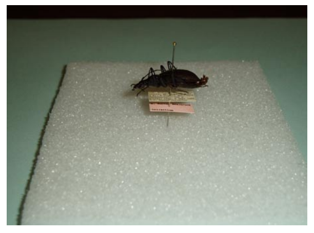
Figure 8: Position of labels underneath specimens.

Small insects of any group should be mounted on points. Points are made with a point punch which creates triangular shaped pieces of cardstock. The insect pin goes through the wide end of the point and the small insect is glued to the narrow point. The point can be curved with forceps to provide additional support for the specimen. Use as little glue as possible and be careful not to obscure any identifying characteristics. The point is glued to the right side of the insect so heads all face right. Very tiny and/or fragile specimens are sometimes double mounted (see references and web pages for details).