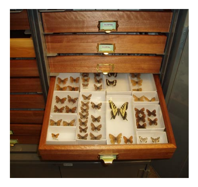
Dried, pinned insects are generally stored in unit trays that are placed in insect drawers which are housed in entomology cabinets. However, a small collection may be housed in

Figure 2: Insect specimen curation in unit trays placed in drawer within entomology cabinet.