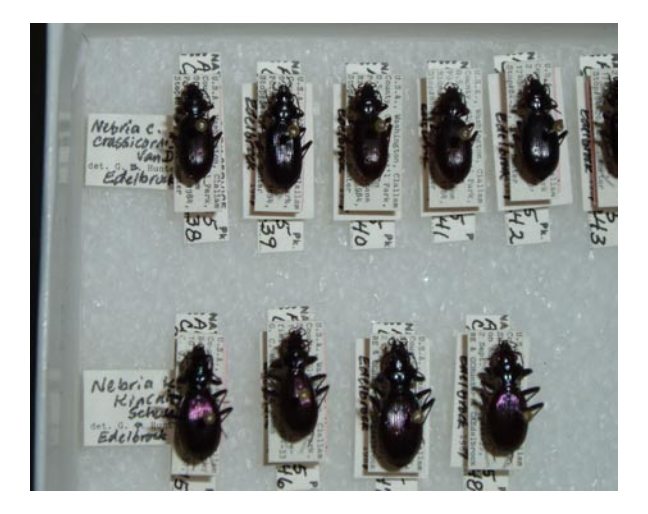
Figure 9: Specimens lined up by species in unit tray.

Due to the diversity of insect species and sheer numbers of representatives, space is of utmost importance in the storage options of insects. Pinned specimens should be labeled with appropriately sized labels and pinned in rows in unit trays as closely together as possible while maintaining enough space to remove individual specimens from the tray. The first specimen of a species should have the identification label turned 90 degrees to the left so it can be read without turning the unit tray.