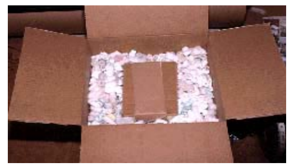
A box of specimens being readied for shipment. Note that ample room has been left on all sides of the specimen container for cushioning material.