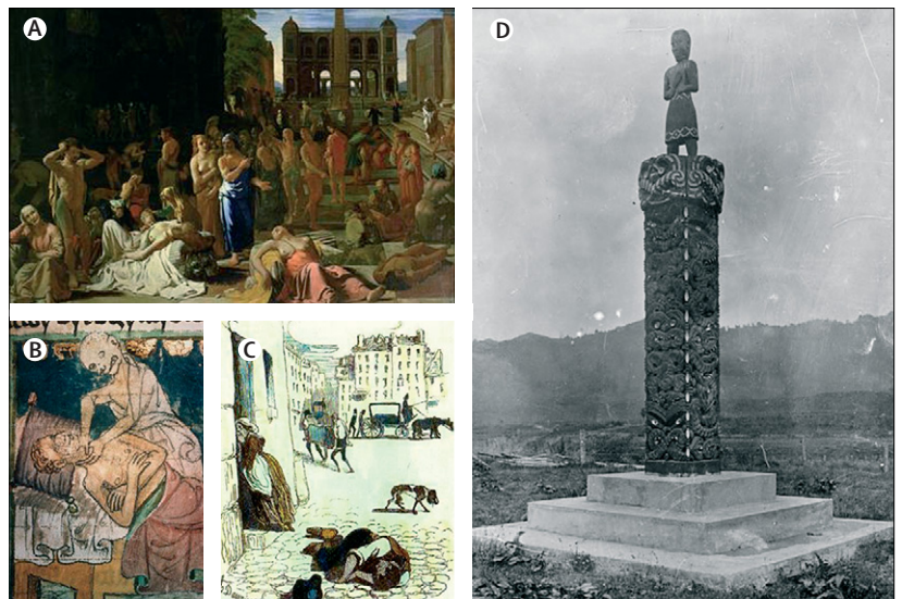
Figure 2: Examples of modern and historically important emerging infectious diseases

Although smallpox may have first emerged in central Africa 5000 years previously—when an animal orthopoxvirus jumped into human beings 48 —the disease had probably not reached the New World. Historians believe that about 3.5 million people in central Mexico died in the first year of the hueyzahtl . By the end of the century some 18.5 (74%) of the 25 million population