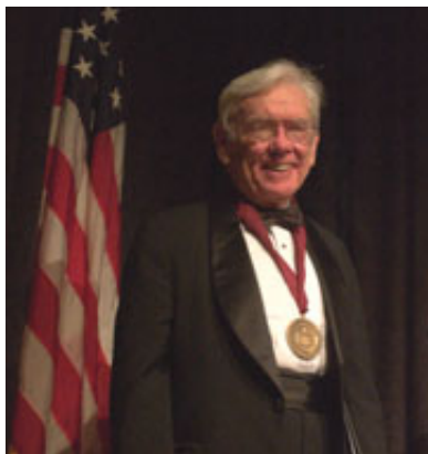
FROM TOP: DR. BILLINGTON, PAUL RICOEUR, JAROSLAV PELIKAN

On November, 29, 2004, Dr. Billington announced the award of the second John W. Kluge Prize for Lifetime Achievement in the Human Sciences to Jaroslav Pelikan of New Haven, Connecticut, and Paul Ricoeur of Paris, France. The Librarian presented the shared award at a formal ceremony at the Library of Congress on December 8, in the Coolidge Auditorium of the Thomas Jefferson Building.