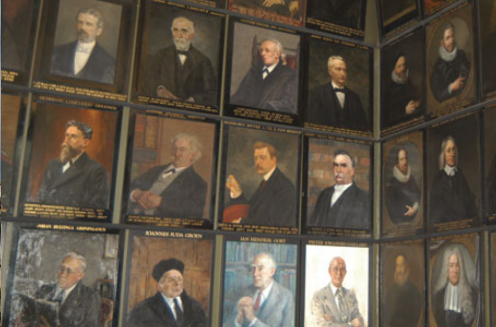
(L) CHAPEL AT MERTON COLLEGE; (R) NOTABLE UNIVERSITY OF LEIDEN ALUMNI AND FACULTY