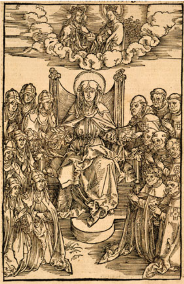
SAINT BIRGITTA BESTOWING THE REVELATIONS ON MONKS AND NUNS, WOODCUT FROM HER REVELATIONES , NUREMBERG, SEPTEMBER 21, 1500