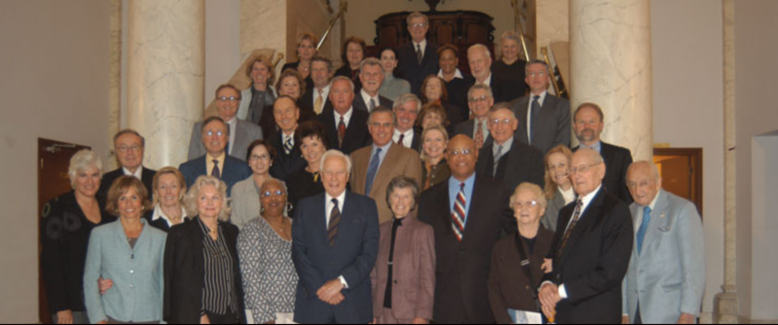
(TOP) SOCIETEIT DE WITTE STEPS AT THE HAGUE; (L) COBHAM MONUMENT; (R) PALAIS DU LUXEMBOURG