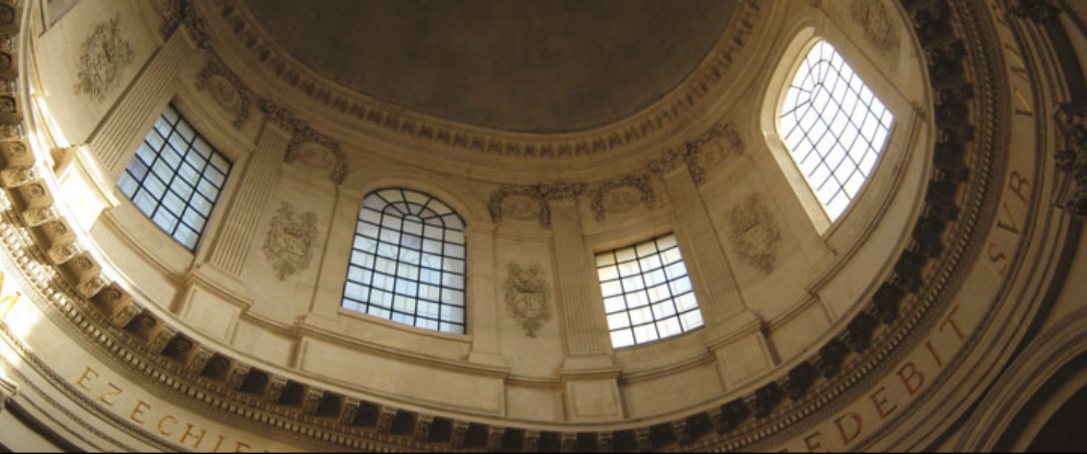
DISTINCTIVE CUPOLA OF THE INSTITUT DE FRANCE