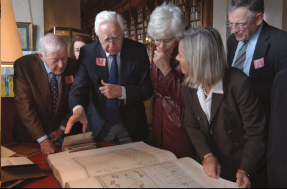
(L) VERMEER'S KITCHEN MAID (c. 1658); (R) TREASURES FROM THE FRENCH SENATE LIBRARY

bourg gardens, and in the adjoining archives, the Council once again reviewed specially selected treasures from the collections.