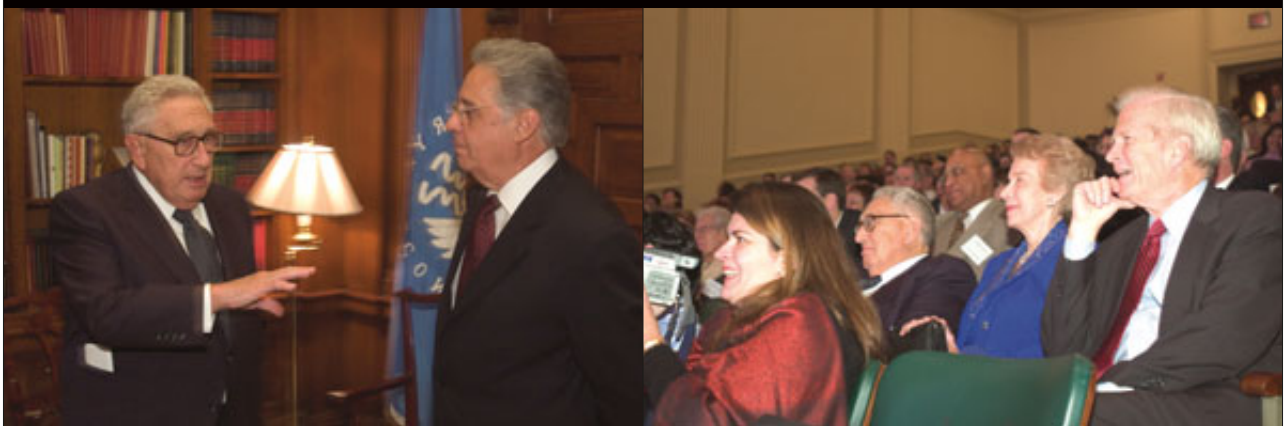
CLOCKWISE FROM TOP LEFT: DR. BILLINGTON AND HENRIQUE CARDOSO; DR. BILLINGTON, HENRIQUE CARDOSO AND HENRY KISSINGER; HENRY KISSINGER AND HENRIQUE CARDOSO; THE BILLINGTONS WITH HENRY KISSINGER