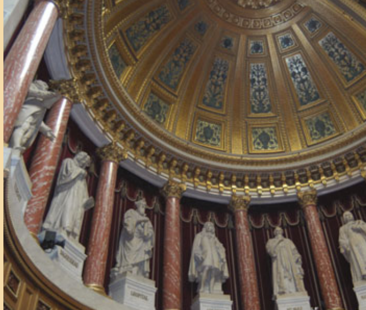
(ABOVE) FRENCH SENATE CHAMBER (BELOW) FIRST CHAMBER OF THE STATES GENERAL AT THE HAGUE

These financial statements should be read only in connection with the accompanying notes to financial statements.