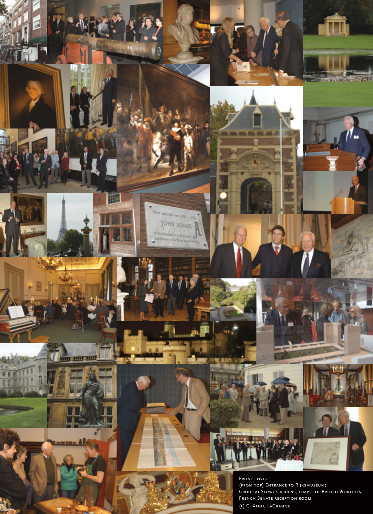
FRONT COVER: (FROM TOP) ENTRANCE TO RIJKSMUSEUM; GROUP AT STOWE GARDENS, TEMPLE OF BRITISH WORTHIES; FRENCH SENATE RECEPTION ROOM (L) CHÂTEAU LA GRANGE