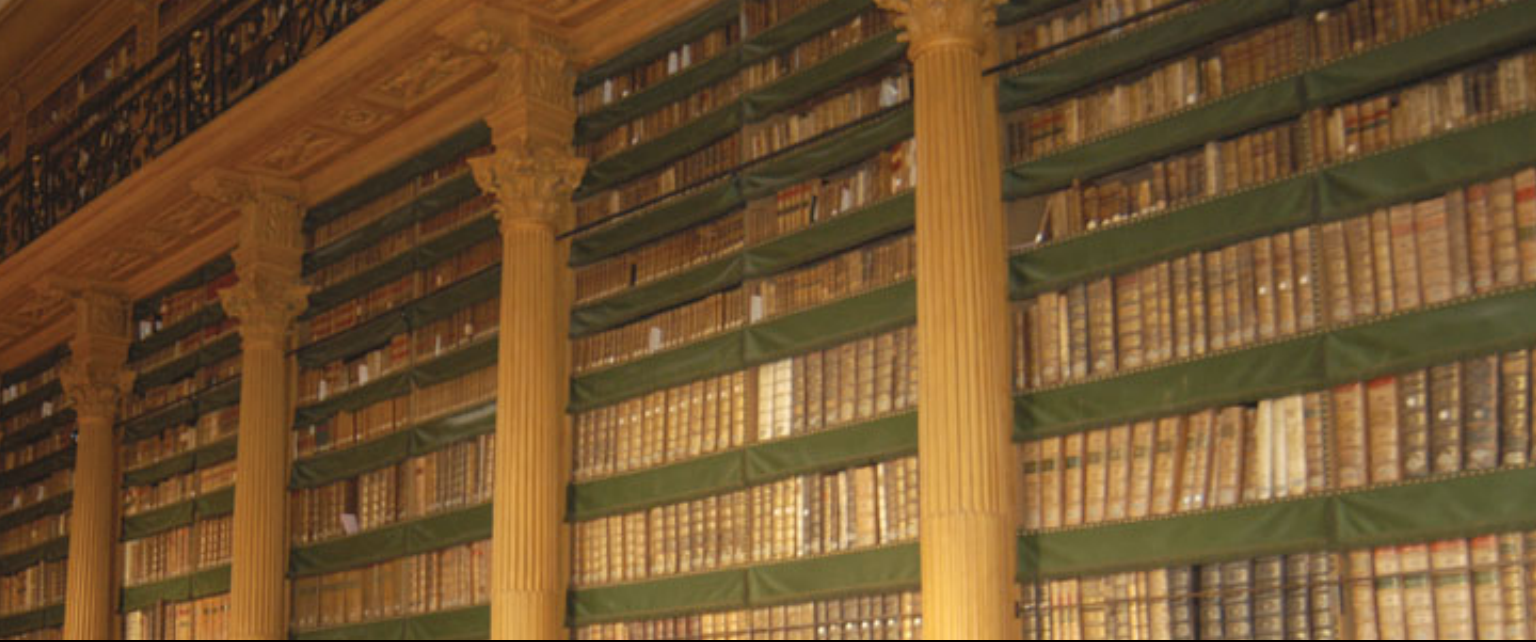
JAMES MADISON COUNCIL OF THE LIBRARY OF CONGRESS