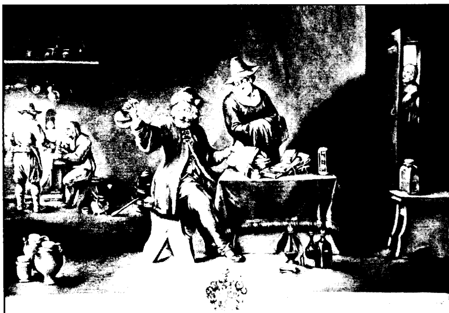
Depiction of urine examination, Seventeenth Century. Print, "Le Medecin Empyrique," by David Teniers, II, 1610-1690, NLM collection

so was their method of cure. The Galenists argued that contraries cure. That is, a disease of a certain quality and magnitude would be cured by a medicine of opposed quality and magnitude. The Paracelsians turned rather to folk tradition arguing that like cures like: a poison in the body would be cured by a similar poison. And when the Galenists charged that the Paracelsians were a veritable legion of homicide physicians, the latter replied that their medicines were safe because they had been altered chemically; moreover, careful attention had been paid to dosage.