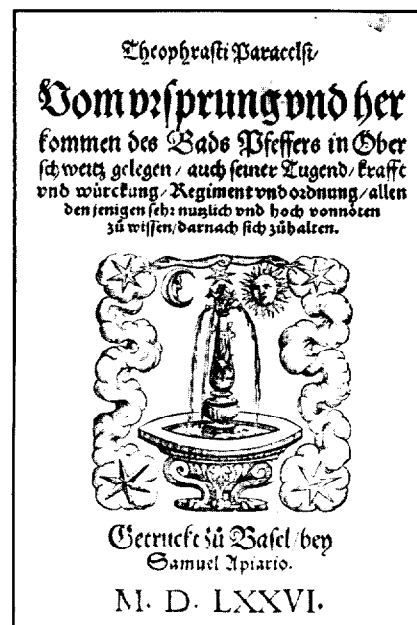
Title page from one of NLM's most recently acquired works by Paracelsus. Paracelsus, Vom Ursprung und herkommen des Bads Pfeffers (Basel, 1576)

In addition to works written by Paracelsus, the Library holds numerous original works by his immediate disciples as well as