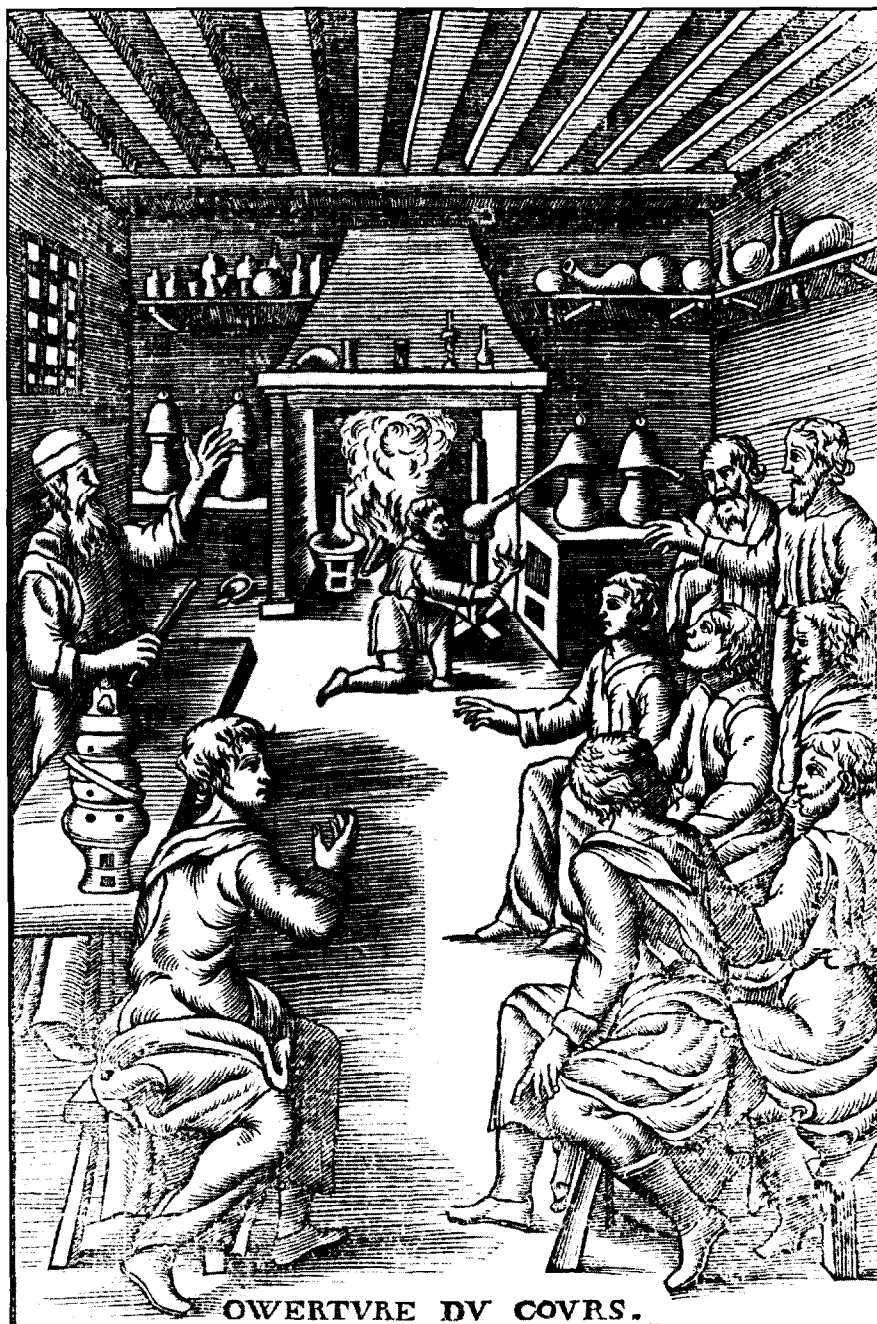
Renaissance instruction in preparation of chemicals. From Annibal Barlet, Le Vray et methodique cours de Chymie (Paris, 1653)

in 1609. The professor, Johann Hartmann was a Paracelsian in the broadest sense, but his teaching emphasized pharmaceutical preparations. He prepared editions of the practical texts of Jean Beguin's Tyrocinium and Oswald Croll's Basilica Chymica which were extremely popular.