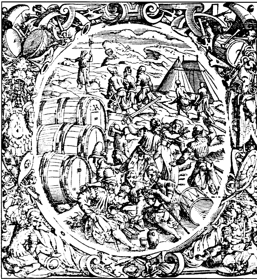
Camp scene showing Renaissance period troops. From Paracelsus, Grosse Wundartzney, Erster Theil (Frankfurt am Main, 1565)

classics, Johannes Frobenius. In Basel Paracelsus also gave medical advice to the Dutch scholar Erasmus and came in contact with some of the more prominent scholars of the religious Reformation. He was appointed city physician and professor of medicine. But although he was permitted to lecture at the University of Basel, he had no official appointment with the medical faculty there.