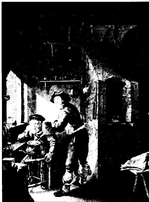
Artist's conception of a mid-seventeenth-century laboratory. Print, Francois V. Mieris, 1635-1681, NLM collection

In the Netherlands Leiden began teaching in chemistry in 1669 and here too the early instructors published their own texts. Both Oxford and Cambridge began courses in chemistry in 1683, and even in Paris the Medical Faculty established a professorial chair for the teaching of both chemical and Galenic pharmacy in 1696. In short, chemistry was well established in European universities by mid-century and it had become almost universal by the end of the century. However, the acceptance of chemistry was through medicine rather than through natural philosophy.