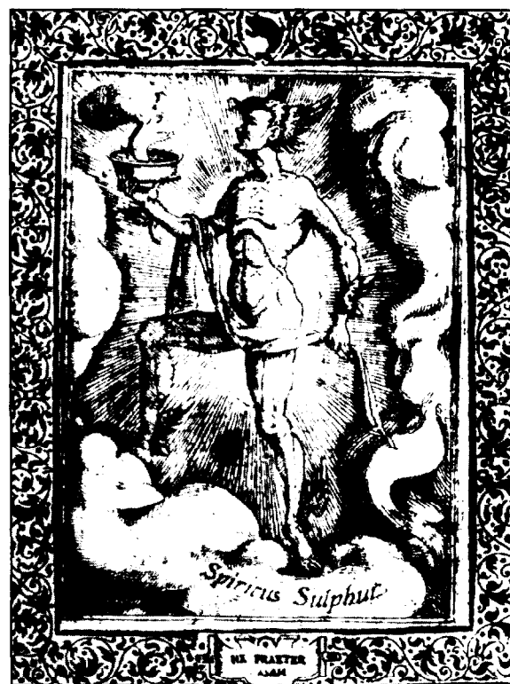
Figure representing “The Spirit of Sulphur.” Engraving from Leonhard Thurneisser zum Thurn, Quinta essentia . . . und Alchemia

The English reaction to the new chemical medicine was closely related to the French scene. As in France, the first English references to Paracelsus appear in the 1560s. In this case we find that the authors had lived in exile in Switzerland during the harsh reign of the Roman Catholic Queen, Mary. But if the London College of Physicians was initially hostile