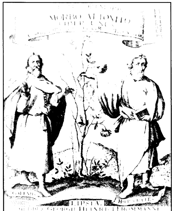
Numerous Renaissance physicians favored the teachings of Hippocrates over those of Galen. From Justi Cortnummii, Di morbo attonito liber unus ad Hippocraticam . . . (Lipsiae, 1677)

A.D. Indeed, for many humanists the discovery of new texts seemed as exciting as the discovery of the new lands being made by contemporary explorers. The result was a new reliance on the truths of antiquity and establishment medicine became increasingly dependent upon the writings of Galen, the "Prince of Physicians." In short, with the corrected translations of ancient