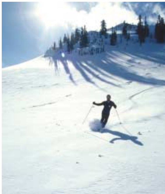
No business like snow business. Environmentalists and ski resort operators continue to be at odds over development.