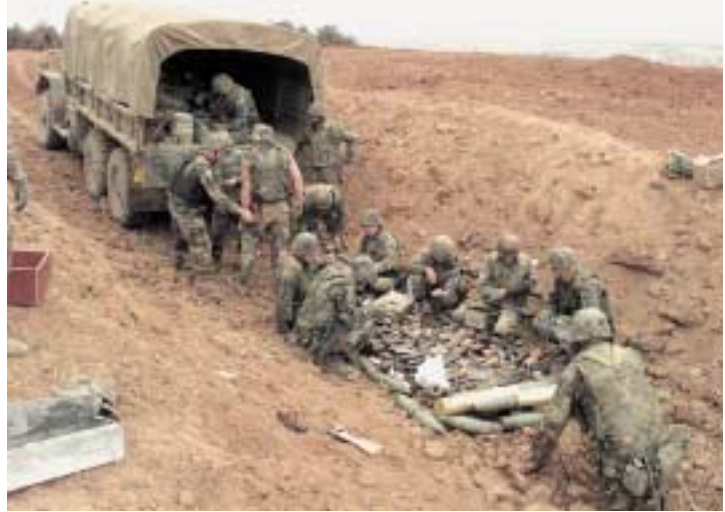
A farewell to arms. U.S. Army soldiers prepare to destroy confiscated weapons in Kosovo.

The report examines all current practical destruction methods and outlines the advantages and disadvantages of each. Methods include burning, burying, cutting into pieces, crushing, shredding, and dumping at sea. The report acknowledges that there are no completely ecologically safe procedures. Open-pit burning, for example, can release toxic fumes through the burning of plastics and polymers. Open-pit detonation can result in noise