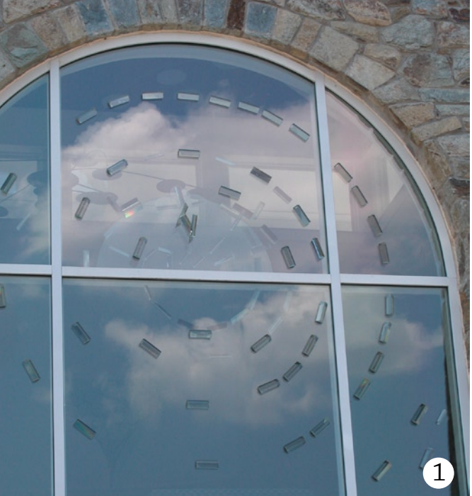
Name That Spot!