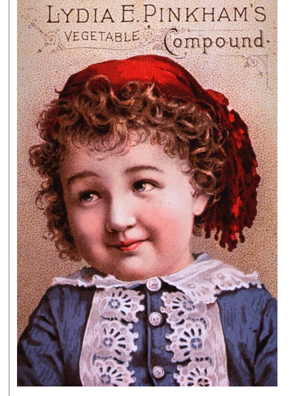
Commodification Meets Black Cohosh NLM Seminar Focuses on 19th-Century Patent Medicine