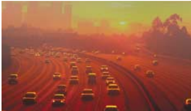
Smog stunts lungs. Results of a long-term study show that air pollutants decrease lung growth in children and may lead to increased risk for respiratory disease as adults.