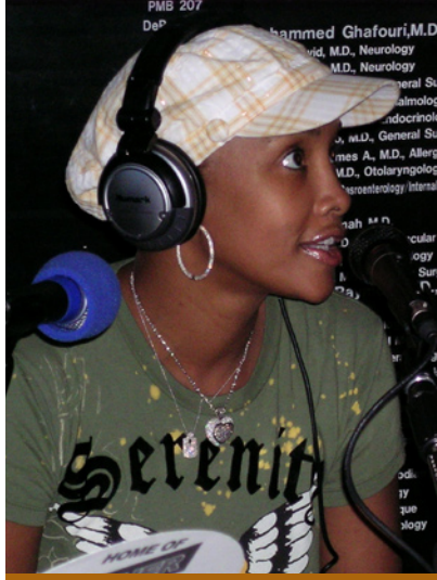
ABOVE • Actress Vivica A. Fox gives NIH outreach a boost. See story on p. 2.