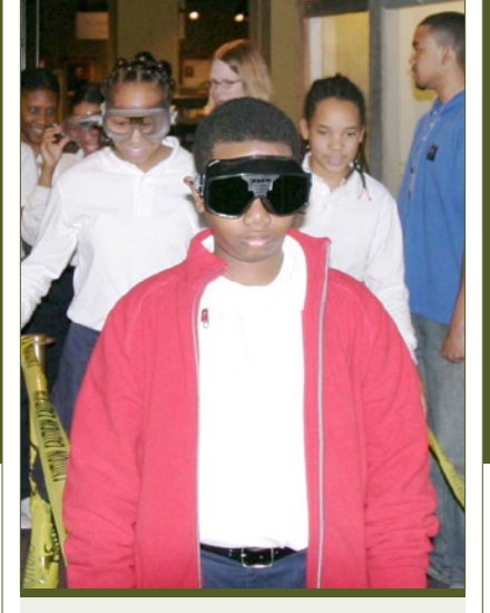
ABOVE · Kids test 'way cool' brain power during NIA-led event at Walter Reed. See photos on p. 9.