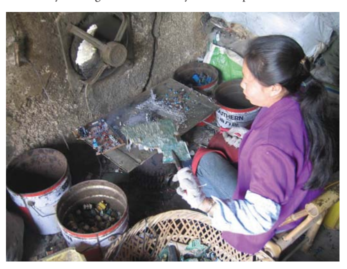
Figure 3. Circuit board baking.

Table 2 presents BLLs for 165 exposed children in the four villages. The findings showed that BLLs from different villages were in the following descending order: Beilin, 19.34 μg/dL > Dutou, 17.86 μg/dL > Huamei, 14.23 μg/dL > Longgang, 13.13 μg/dL (Table 2). Children living in Beilin, where the number of e-waste workshops specializing in equipment dismantling, circuit board baking, and acid baths, had the highest BLLs. Dutou,