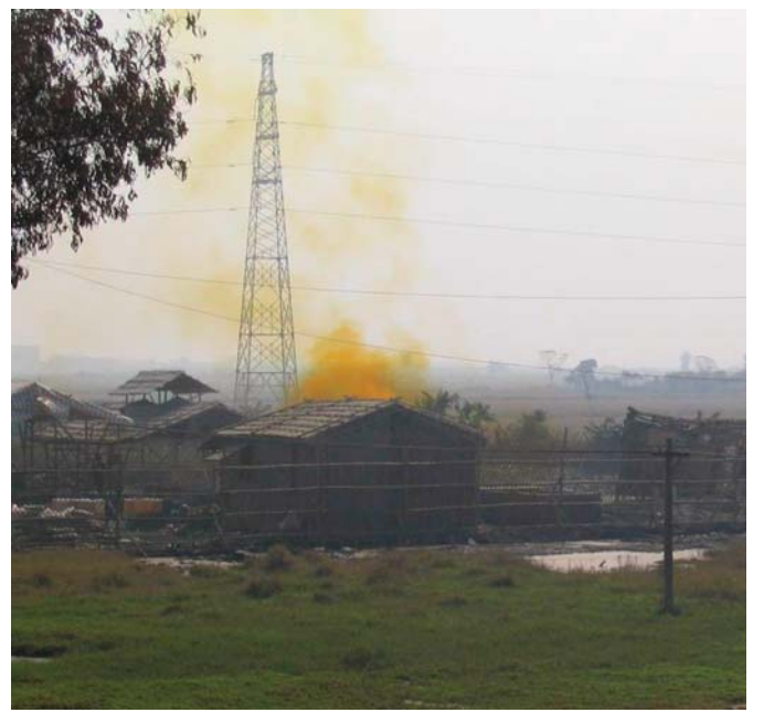
Figure 5. Yellow smoke from acid bath hut.