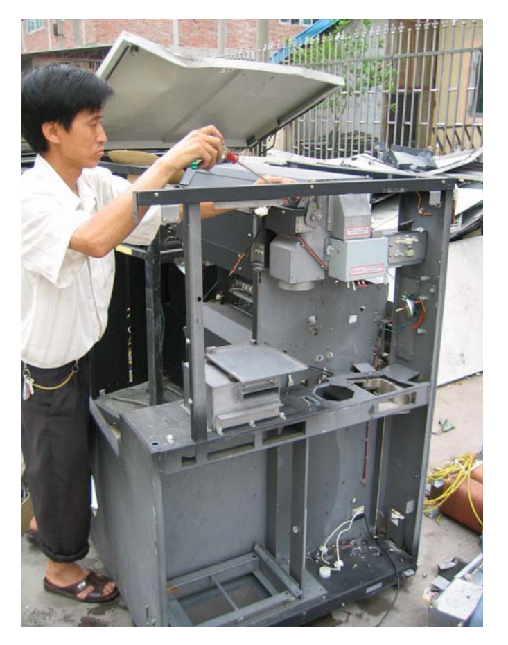
Figure 2. Equipment dismantled with simple tools.