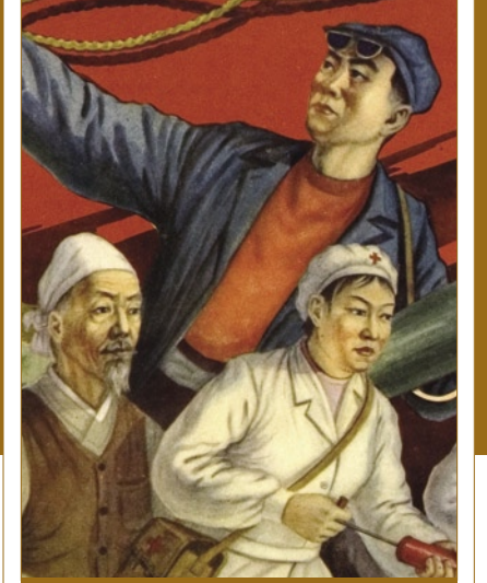
ABOVE • Pictures can be worth a thousand words in conveying health messages. See story below.