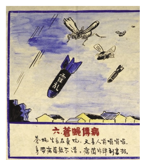
"Americans Dropped Germs": A Korean War-era poster warns against germ warfare and demonizes the enemy.

Eliminate the Four Pests: A line of advancing workers bears a mosquito net, insecticide sprayer and flyswatter. This is emblematic of a 1960s campaign against "the four pests"—rats, flies, mosquitoes and sparrows.