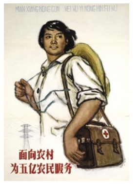
In 1965, a massive public health campaign used posters touting "barefoot doctors," who served China's peasant population.

Say you have a public health problem whose scale is vast: a population of 500 million, with 90 percent living in the countryside, where the literacy rate is 5 percent and life expectancy is 35