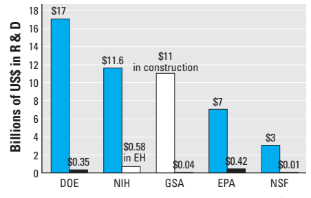
Figure 2. U.S. government investments (US$) in research to achieve healthy indoor environments (Office of Management and Budget 1998). Abbreviations: DOE, Department of Energy; EH, environmental health; EPA, U.S. Environmental Protection Agency; GSA, General Services Administration; NIH, National Institutes Health; NSF, National Science Foundation. Blue bars, total U.S. federal research funding; black bars, U.S. built environment research funding; GSA white bar, total construction dollars, not total research dollars; NIH white bar, environmental health research funding but not directly built environment research funding.

Household appliances. Decisions about the types of appliances that are purchased can be driven partly by personal cleaning habits, for example, how clean the residence is kept. Further, using air-conditioning while sleeping can lead to a considerable build-up in the room of carbon dioxide ( CO_2 ) from all types of air-conditioning systems. These CO_2 levels were substantially higher than the levels in naturally ventilated bedrooms. A survey was conducted to investigate whether the occupants exhibited