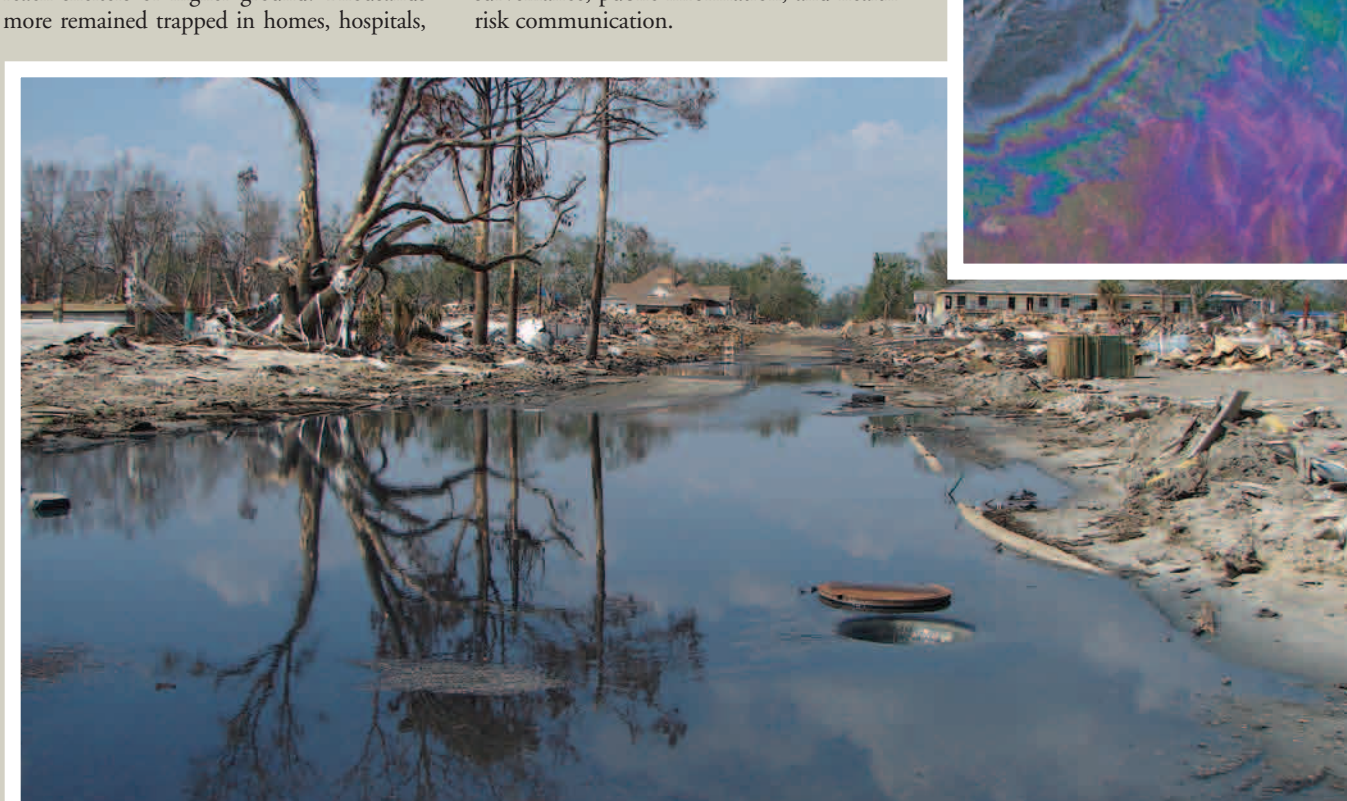
Hazards in wading? Initial reports labeled the floodwaters through which many New Orleans residents were forced to wade a "toxic gumbo." Later testing of stormwaters found elevated levels of fewer contaminants than feared, but sampling was limited and the water may yet present long-term problems.

In advance of the storm's arrival, the EPA had predeployed teams to the area, with the mission of guiding debris disposal, assisting in the restoration of drinking and wastewater treatment systems, and containing hazardous waste spills. Immediately after the storm, these teams used their 60 watercraft to help searchand-rescue efforts, rescuing about 800 people, according to EPA administrator Stephen Johnson. Five days after the storm, the EPA