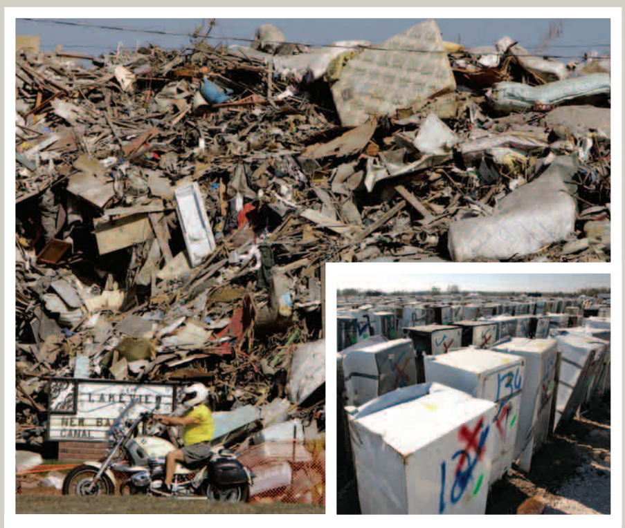
Waves of destruction. (above) A motorcyclist rides past a mountain of trash, wallboard, and furniture removed from homes damaged by Katrina. (inset) Thousands of damaged refrigerators await safe disposal at a landfill near New Orleans. The freon in these appliances will need to be handled carefully.

Air may also play a role in an illness known as "shelter cough," or "Katrina