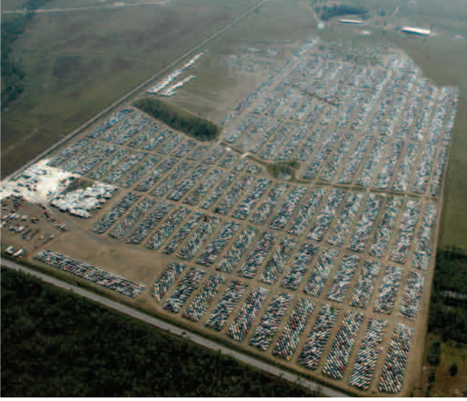
Vehicle slaughter. Vehicles destroyed in the storm surge of Hurricane Katrina (left) are being stockpiled north of Gulfport, Mississippi (right). The thousands of automobiles are just the tip of the iceberg of waste that communities must deal with as a result of the hurricane.