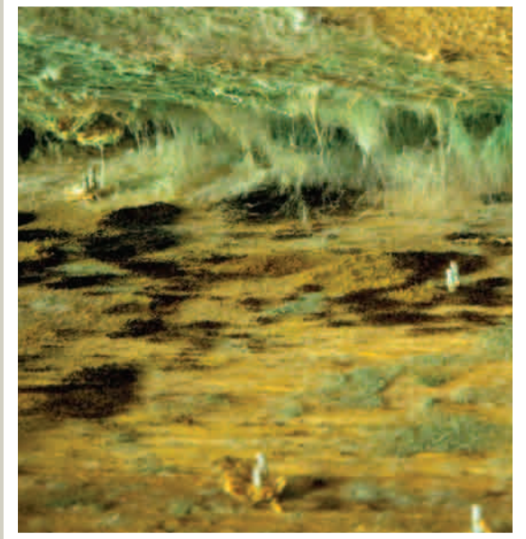
Opportunistic attacker. The warm, damp conditions left in homes following Katrina provided the perfect medium for the growth of mold. Because mold can be extremely toxic and hard to eradicate, many homes may not be salvageable.

Health and housing officials advise homeowners and renters to throw out any furnishings, insulation, and bedding that may have