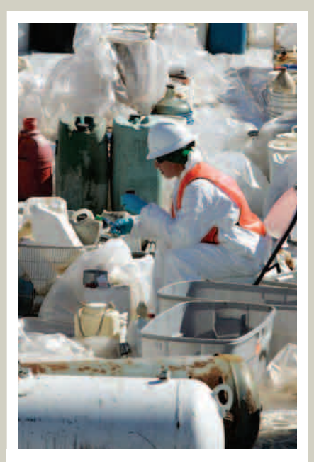
Chemical calamity. A worker tests hazardous household liquids at the Fort Jackson "orphan" tank and drum staging area in

Many health care professionals worry that mental health may be the most serious longterm health issue resulting from Katrina. Hundreds of thousands of people across the Gulf region have had their homes destroyed. Thousands are still living in shelters. Many have no jobs, no health insurance, and no job