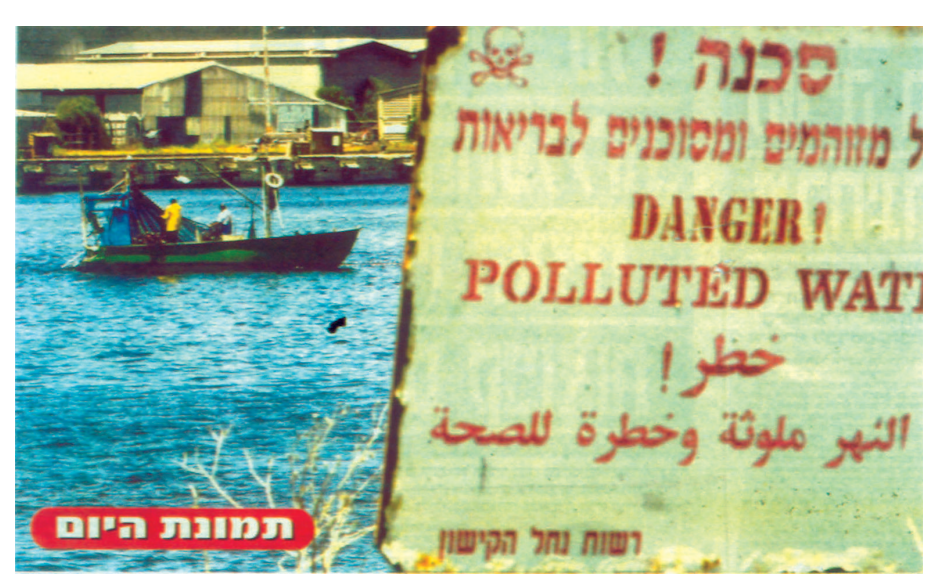
Figure 2. Warning sign, Kishon River.