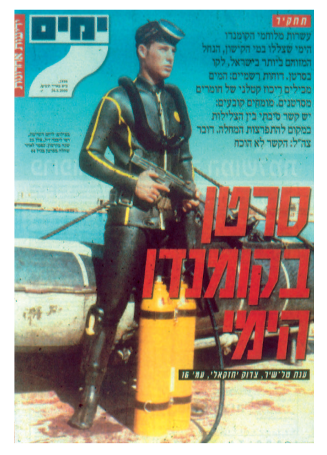
Figure 1. Naval commando diver.

Risk estimates and statistical analysis. We carried out two analyses. The first compared risks for cancer (all combined and specific organ systems) among divers first diving before 1960 and those first diving after 1960. The second analysis compared risks in five cohorts defined by decade of first diving: 1948-1949, 1950-1959, 1960-1969, 1970-1979, and 1980-1995. In both cases, we calculated the average age of diagnosis and the observed cancer risk per person-years of risk within the cohort. Because nearly all the cases were Israeli born, we used 1993 age-specific morbidity incidence rates for the equivalent age of Jewish males born in Israel as reported by the Israel Cancer Registry (ICR 1996) to calculate observed/expected (obs/exp) ratios. We also calculated risks and obs/exp ratios for specific tumor sites. Because the numbers were much smaller, we restricted ourselves to a comparison of risks for specific tumor sites among those first diving before and after 1960.