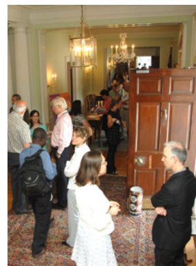
Guests fill Stone House entryway for party.