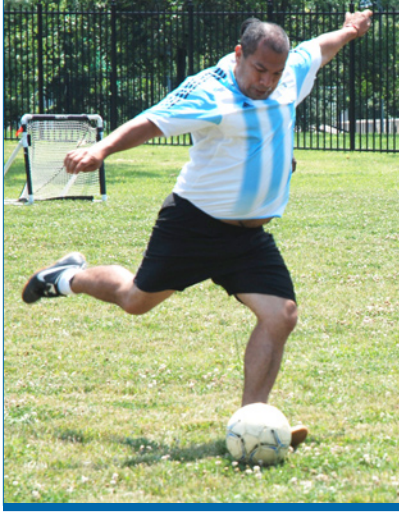
ABOVE • A dedicated cadre of NIH'ers play pickup games of soccer at lunch time. See story, more photos on p. 12.