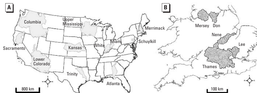
Figure 2. Illustration of the distribution of catchments we investigated within (A) the United States [adapted from Anderson et al. (2004)] and (B) the United Kingdom.

A river water OC concentration of 1 nM is 1.6–625 times higher than three commonly