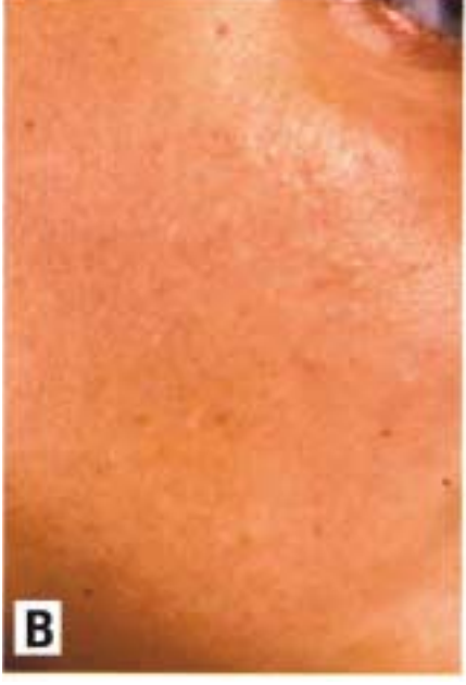
Figure 2. Clinical picture of chloracne in Patient 2. (A) Multiple closed and opened comedones were confined to the malar region at the time of chloracne diagnosis. (B) After one year of treatment with topical tretinoin (Retin A cream), the acne lesions had almost completely cleared.

validated in international intercalibration exercises.