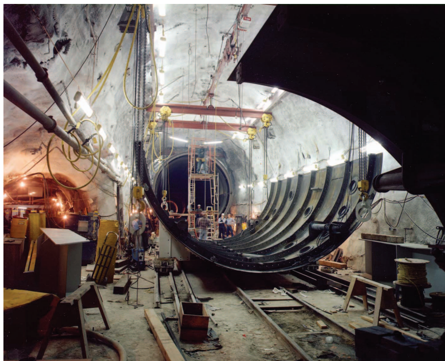
Figure 2. Nevada Test Site.

Crystalline silica particles are ingested by alveolar macrophages and result in inflammation and activation of fibroblasts (Parks et al. 1999). The digested crystalline silica destroys the macrophages, and the crystalline silica is again digested by new macrophages. This repeated process leads to chronic immune activity and fibrosis. Studies have shown that crystalline silica can be mobilized from the lungs to other organs, including lymph nodes, spleen, and kidney (Parks et al. 1999). Silicosis and mineral dust pneumoconiosis have been linked to an increase in autoantibodies, immune complexes, and excess production of immunoglobulins, even in the absence of a specific autoimmune disease (Jones et al. 1976; Lippmann et al. 1973). Many of the cases of autoimmune disease were first discovered during screening of silica-exposed workers or workers who were being treated for silicosis. It was not clear in these cases whether the silicosis was a pathologic process that may predispose some individuals to develop autoimmune disease or whether the opposite was true, that the autoimmune disease may