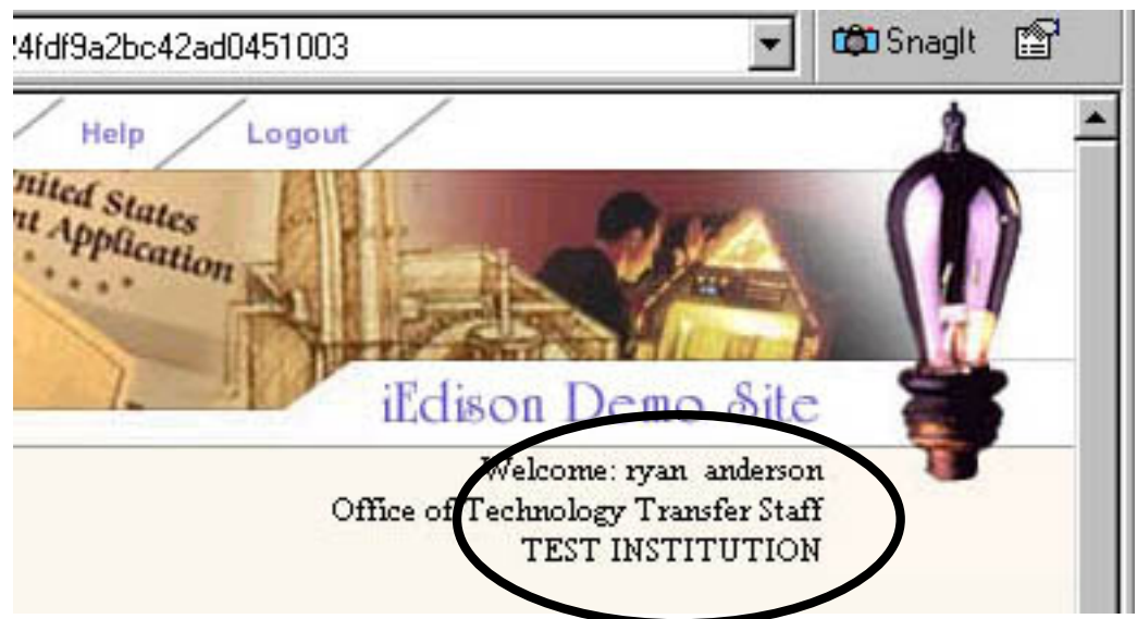
Figure 1 – The New iEdison Demo Site Logo