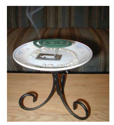
Figure 1. A mosquito coil containing allethrin and S-2 burning to kill or repel mosquitoes in family living quarters. The coil is secured to a small metal stand, and it will burn about 8 hr. The plate retains segments of ash as the coil burns.

Only d -allethrin products were used for this study. d -Allethrin products that listed S-2 and others that did not list S-2 on the label contained S-2 in highly variable amounts (0.001–0.7% wt/wt). This may reflect the fact that an estimated 30% of pesticides marketed in developing countries do not meet internationally accepted quality standards (WHO 2003). The chemical composition of mosquito coils included other unknown and unquantified chlorinated dialkyl ethers. S-2 from different sources has notable genotoxicity and irritancy (Pauluhn 1996). No other pyrethroids used in mosquito coils, including