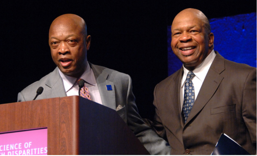
SUMMIT CONTINUED FROM PAGE 1