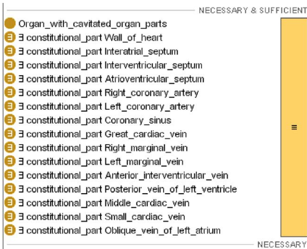
Fig. 4. The defined class Heart.

tom_partonomy , and is therefore computationally more significant. But, such a definition is not “semantically” satisfying for all classes: all anatomical entities cannot be uniformly defined solely in terms of their constitutional parts (the same parts may belong to different structures), and no such constitutional parts are defined for most FMA classes. However, the choice of constitutional_part was deemed appropriate for the purpose of investigating reasoning services. Different definitions for the different subtrees, and more complex expressions combining several properties shall be investigated in the future (Section 4).