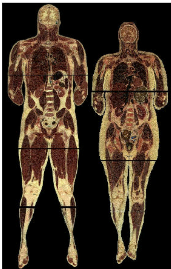
Fig. 1. Reconstructed frontal section through the Visible Human male and female.

The NLM in partnership with six other U.S. government agencies is sponsoring research and development which will further the core goals of the VHP in three areas: