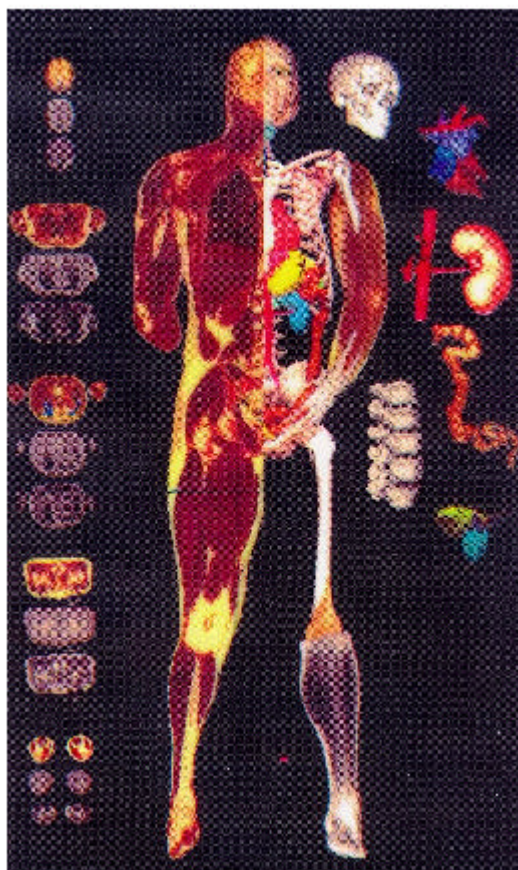
Fig. 3. Current bitmap version of the Visible Human data set (data) on the left versus the future object version (knowledge) on the right.

The ITK API has undergone continuous review and modification by the expert developers on the programming team. The software toolkit is being designed to support a variety of visualization and/or rendering platforms and to be easily integrated into existing processing, visualization and presentation systems. The completed software toolkit, including all source code and