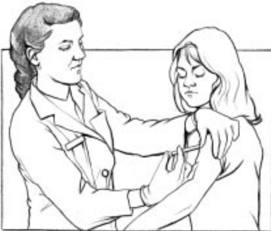
Vaccines protect you from getting hepatitis A.

You need all of the shots to be protected. If you are traveling to other countries, make sure you get all the shots before you go. If you miss a shot, call your doctor or clinic right away to set up a new appointment.