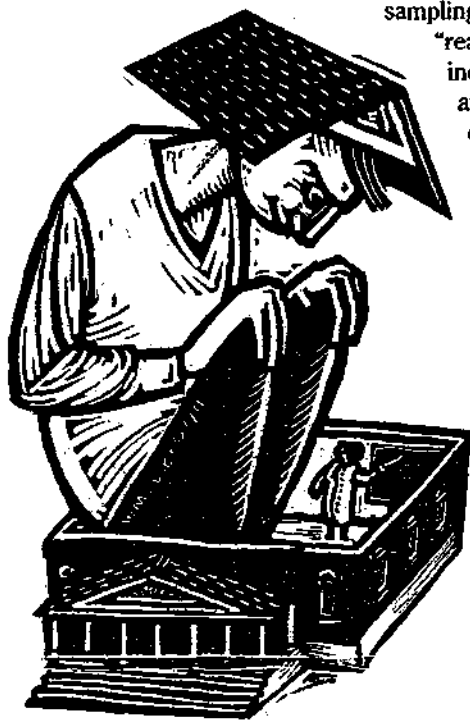
ILLUSTRATION BY WILLIAM L. BROWN FOR THE WASHINGTON POST