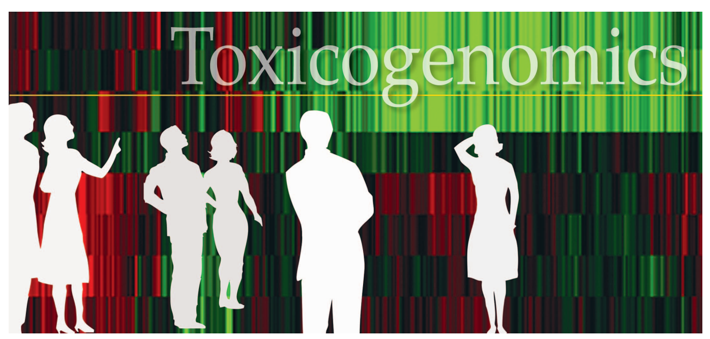
Working together. Researchers are sharing experience, best operating practices, and data to achieve standardization in toxicogenomics data.

The broad impression imparted by the papers, as expressed by Pennie and colleagues in their overview of the program, is that "genomics, and more specifically toxicogenomics, can no longer be regarded as 'new' technology." With increasing experience has come increasing awareness that toxicogenomics is fast maturing. The field has proven its value with solid research and significant additions to the scientific knowledge base; its utility in mechanism-based risk assessment is less likely to be considered tentative, potential, or pending. –Ernie Hood