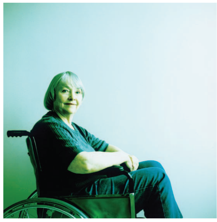
Hope may come from HDAcs. More information on how histone deacetylase (HDAC) compounds control cellular function could eventually lead to treatment for conditions such as Huntington disease.

Another mystery is why diverse proteins are attached to the HDAC/BHC110 core, in contrast to the other HDACs, which bind only one type of protein to their cores. Shiekhattar suspects that the different proteins direct the complex to specific tissues. For instance, one member of the new family contains the ZNF217