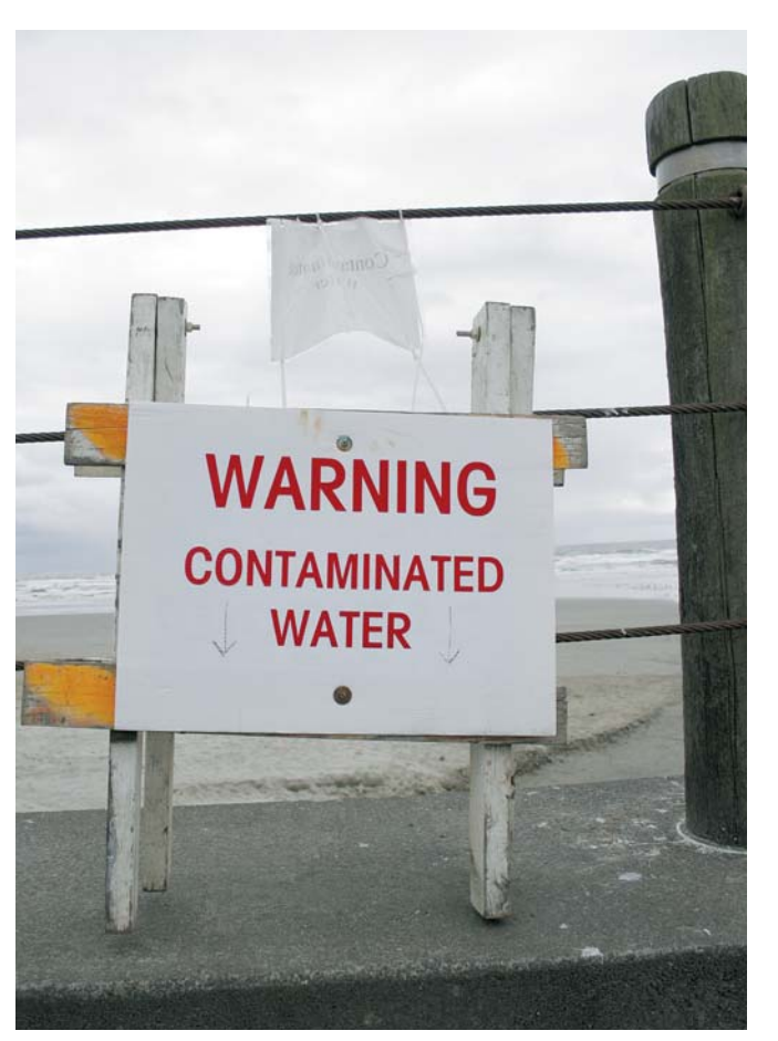
Wave of the future? If validated, a modified polymerase chain reaction method may become useful for earlier identification of hazardous beach water conditions.

The researchers conducted health surveys of beachgoers at two public beaches, one on Lake Michigan and one on Lake Erie, and compared them with thrice-daily water quality measurements along transects at the beaches. They evaluated water quality using a modified version of the polymerase chain reaction method