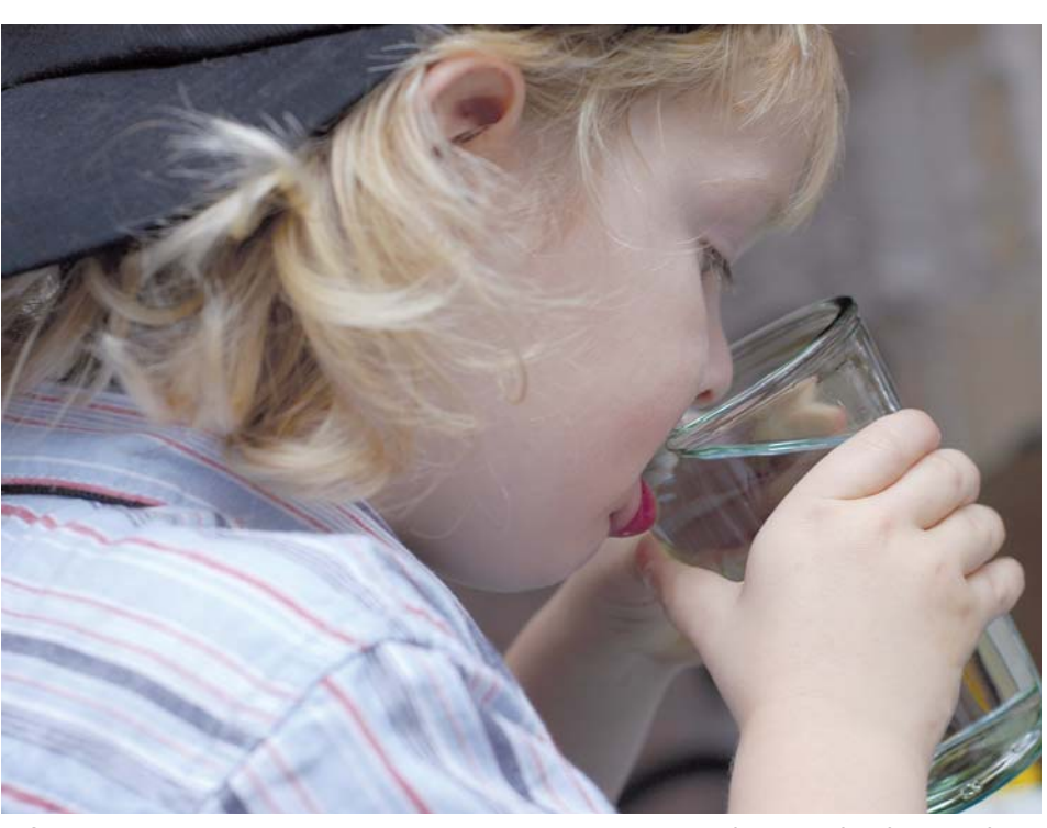
Refreshing news. Although some questions remain, a new data analysis fails to confirm fears that fluoridation of drinking water results in higher blood lead along with stronger teeth.

the silicofluoride compounds in tap water might enhance lead leaching from pipes and increase lead absorption from the water itself. Elevated PbB concentrations in children are associated with a host of cognitive, developmental, and behavioral impairments so