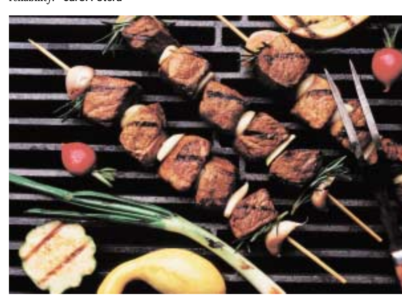
Meal planning. Data showing that consumption of pesticides varies seasonally may help researchers design better studies in the future.