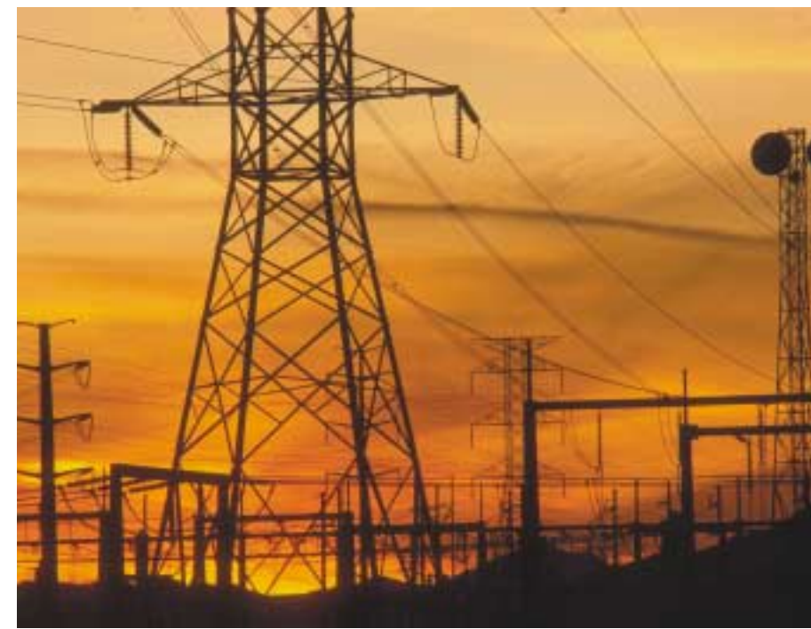
A different role for electromagnetic fields? A 1979 study found that children who lived near power lines (and consequently had higher ELF-EMF exposures) had a higher incidence of cancer. Although most scientists believe ELF-EMFs are too weak to initiate cancer, new research suggests they could play a role as cancer promoters.

While the study showed that ELF-EMFs could conceivably play a biological role in carcinogenesis, cancer-promoting chemicals require a long exposure to promote cancer, and human exposures to ELF-EMFs are hard to gauge. Because electric fields change so radically from point to point, it's too early to say if typical exposures actually promote cancer. But by stressing the importance of promotion, the study could focus future research on the environmental health effects of ELF-EMFs. –David J. Tenenbaum